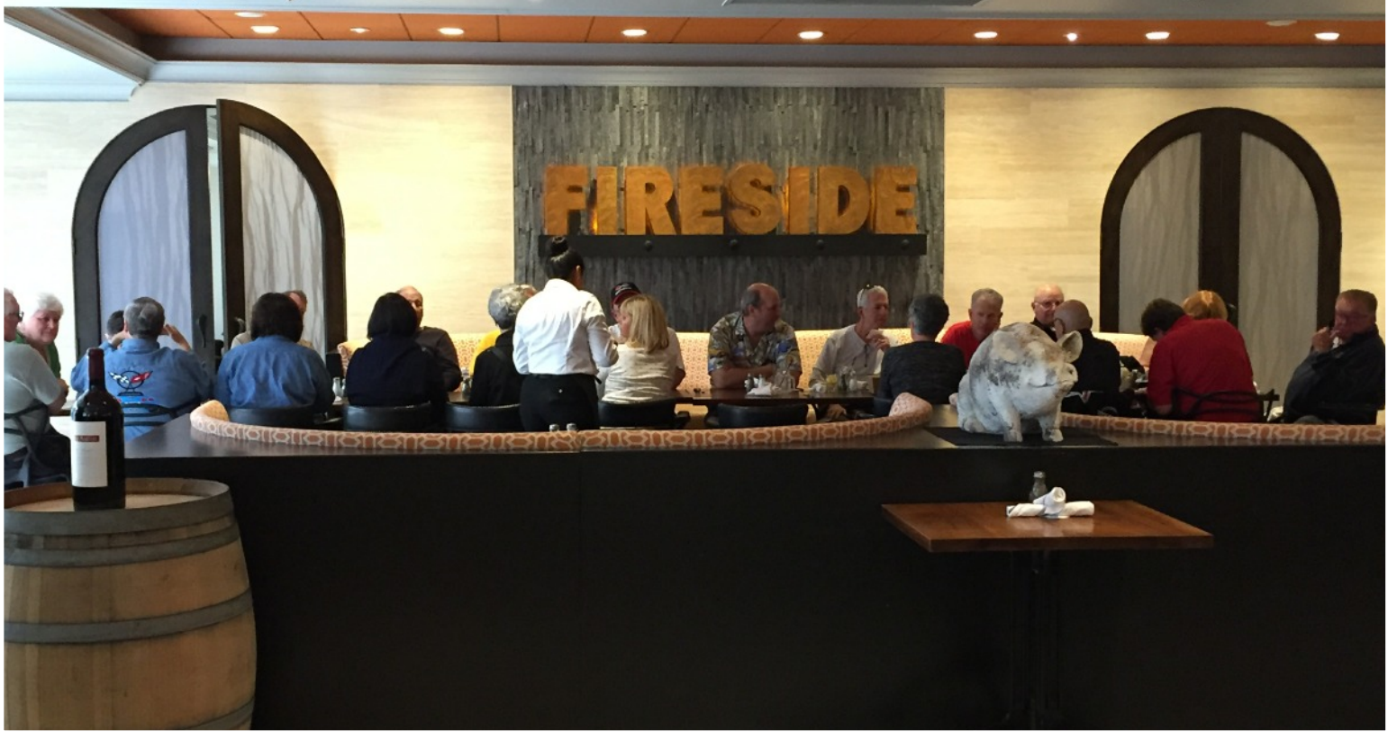
Enjoying lunch after looking at all those amazing Crevier Classic Cars.